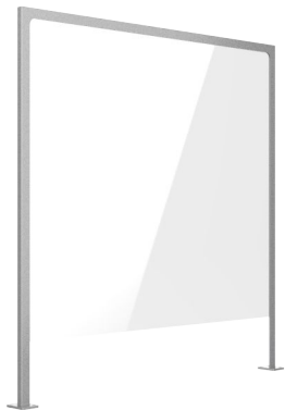
3' W x 3' H