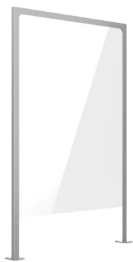
2' W x 3' H